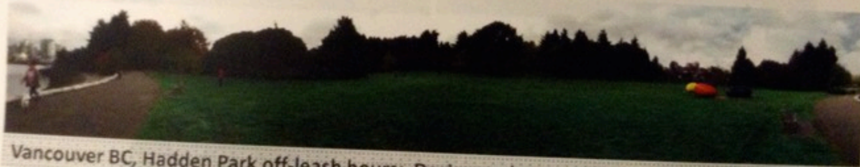
Vancouver BC, Hadden Park off-leash hours: Designated areas, same as park hours