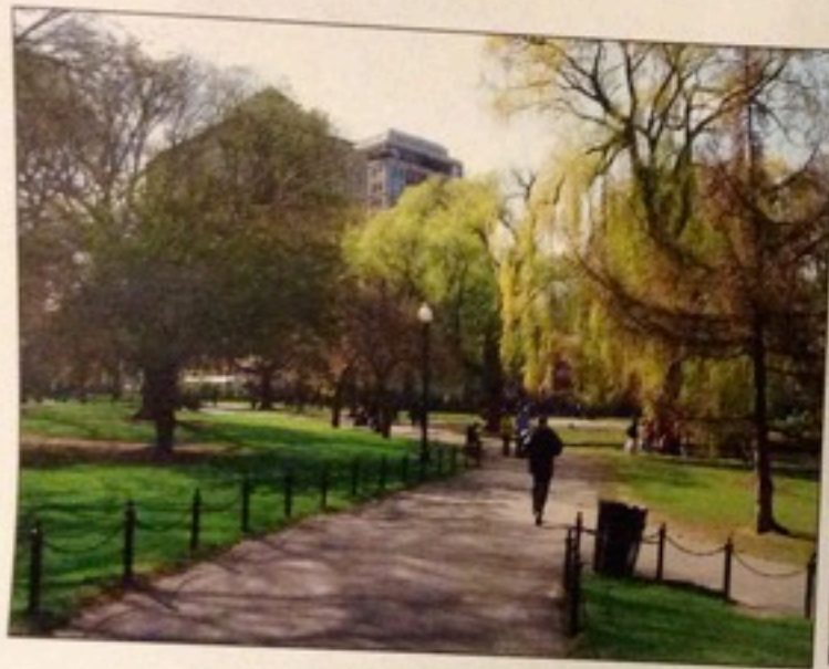
Boston Commons off-leash hours: 6am and 9am and again from 4pm to 8pm