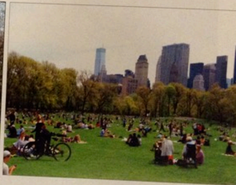
NYC, Central Park off-leash hours: 6am to 9am and from 9pm to 1am