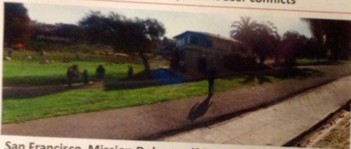
San Francisco, Mission Dolores off-leash hours: Designated areas, same as park hours

If multi-use with no fence, cities have found space needs to be greater than one acre to prevent user conflicts