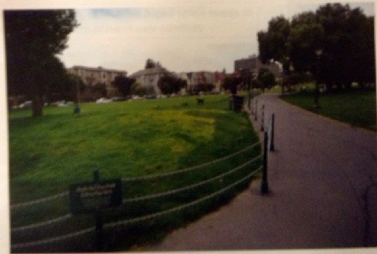
San Francisco, Duboce off-leash hours: Designated areas, same as park hours